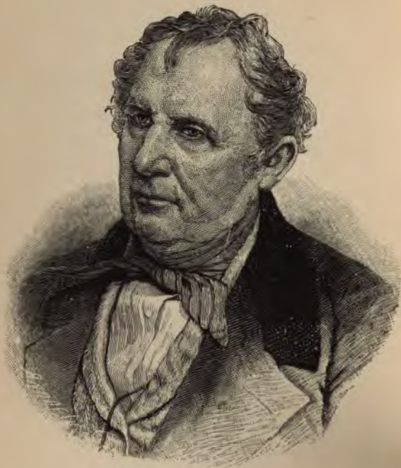
J. Fenimore Cooper